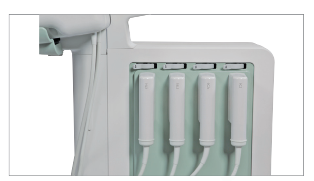
Transducers can be connected and removed with one hand